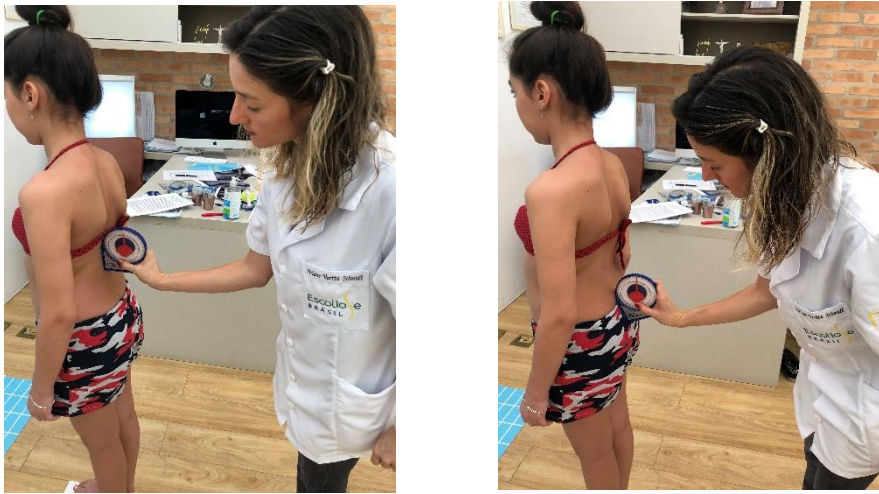
Figure 3. – Representation of the sagittal angles of thoracic kyphosis and lumbar lordosis on the inclinometer of adolescents with idiopathic scoliosis.