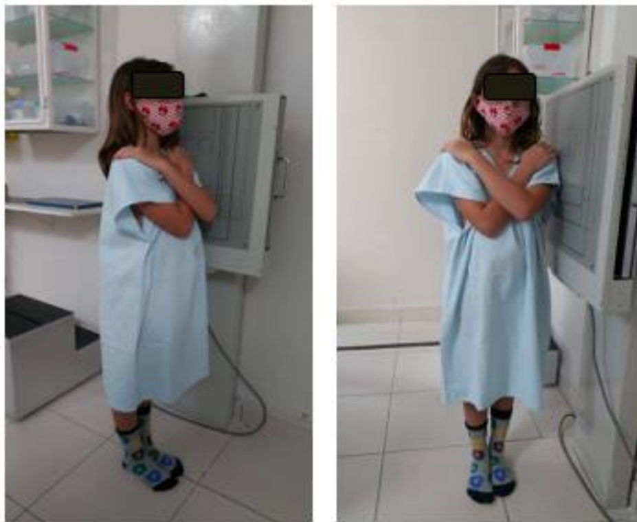
Figure 1. Representation of the performance of the frontal and sagittal profile of the X-ray image exam.

Each adolescent was recruited for two evaluations: first, biplane radiography and second, inclinometer evaluation. It is worth mentioning that the radiographic evaluations were performed on different days, considering the time taken by the patient to schedule the same. When performing a biplane, a two-dimensional radiographic image, all adolescents underwent the X-ray image in the sagittal profile of the spine as part of the medical request to monitor and confirm the diagnosis of idiopathic scoliosis (Figure 1) (17) . To undergo the X-ray examination, adolescents remained in an orthostatic posture in a standing position supporting their own body weight. The patients' feet remained in the same alignment in the frontal plane, with 7.5 cm between them. To reduce artifacts due to the projection of the humerus overlapping the spine, side imaging was completed with adolescents crossing their arms, fingers resting on the collarbones. The X-ray images were digitized and analyzed by physical therapist 1. After four weeks, the images were reevaluated by the same physical therapist and by a second physical therapist.